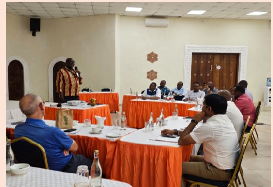
Pic showing KAHC south coast region members meeting at Neptune Convention Centre, Diani on 08.09.23