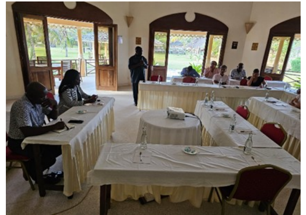
Pic showing Kilifi Members Regional meeting held at Ocean Beach hotel 04.09.2023

We also had regional engagements in Nairobi where we visited members as we continue with our outreach.