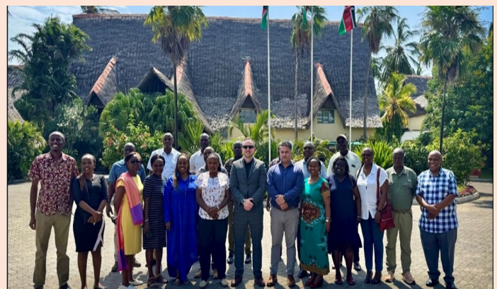
PRINCIPLES OF SITE SECURITY SURVEYS COURSE BAHARI BEACH HOTEL | MOMBASA | 27TH - 31ST JANUARY 2025 Kenya Tourism Federation

The training was insightful and had an in-depth look at the tasks and areas that are overlooked in security checks and how a thorough step by step process can be used to ensure site security.